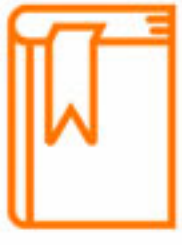
Table Booking System

Our Point Of Sales system cover the whole range of what a restaurant needs. It includes an efficient & effective solution for customer to book table in advance. It has the flexibility with options to book a table, a whole room for functions or book multiple tables. Table Booking System is designed to manage & monitor real-time status of every table and shows table activities at current time and at certain point of time. This booking system allows customer to place a list of food they would like to order. This feature enables management to prepare all the resources necessary beforehand.